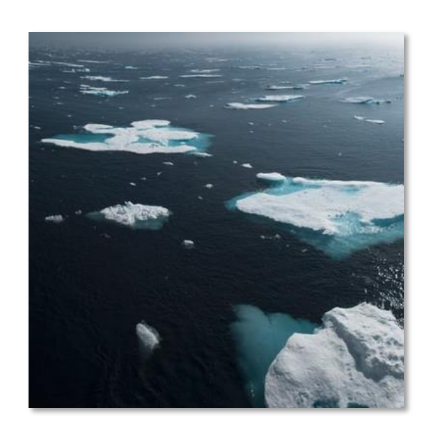
World's temperature rising by 1.5 degrees