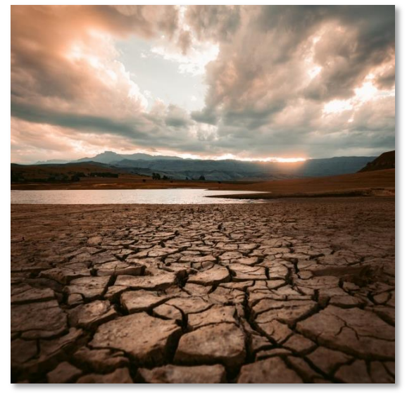
Droughts may displace more than 200m people